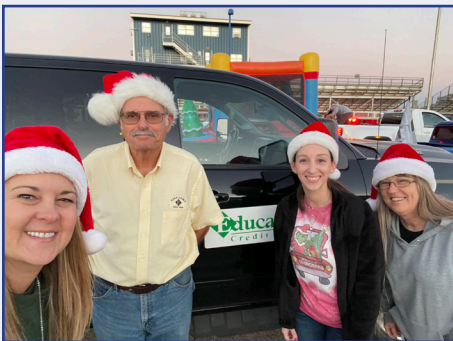
Fun at the Lacy-Lakeview Chamber Christmas parade!