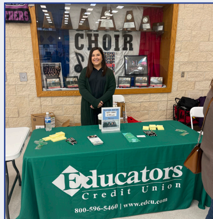
In January, ECU was at the Midway ISD Mind & Body Expo.