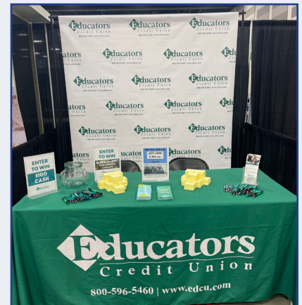
We had a booth at the HOTBA Home Show in February.